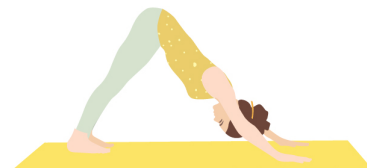
Downward-Facing Dog Adho Mukha Svanasana