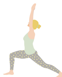
Crescent Pose Anjaneyasana