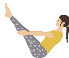
Boat Pose Paripurna Navasana