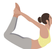
Bow Pose Dhanurasana